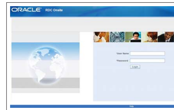
Oracle RDC Onsite 4.5.3